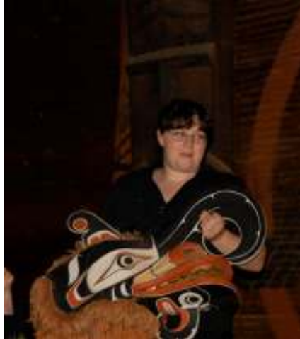
Presentation at the Lelooska Long House